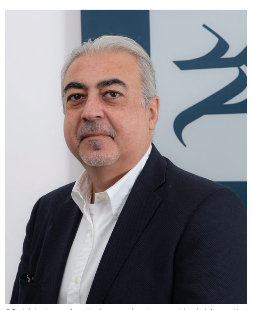
lack {f \cap} Oracle helped in a smooth transition from on-premise system to a cloud-based solution, says Alaasi.

"Oracle helped in a smooth transition from our traditional on-premise solution to a cloud-based solution, which was the need of the hour to achieve organisational digital transformation as our workforce had quadrupled from 100 to 400," Alaasi adds.